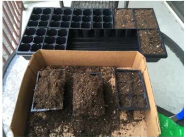
Filling the trays with potting soil

penetration. The potting soil should then be leveled a little below the rim of the cells so that the water can soak in when watering without running off.