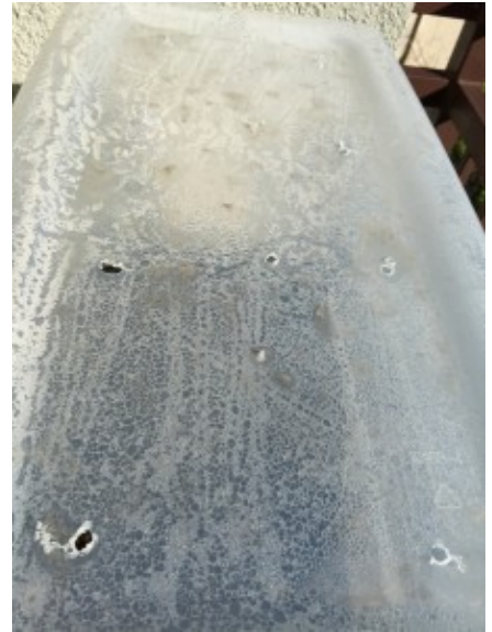
Add ventilation holes

Seeds will take anywhere from a few days to a couple of weeks to germinate. This information should be printed on the seed packet or can be looked up online. In our case, the tomato seedlings are up and growing after a week, but we are still waiting on the eggplant seedlings which will take at least another week to germinate.