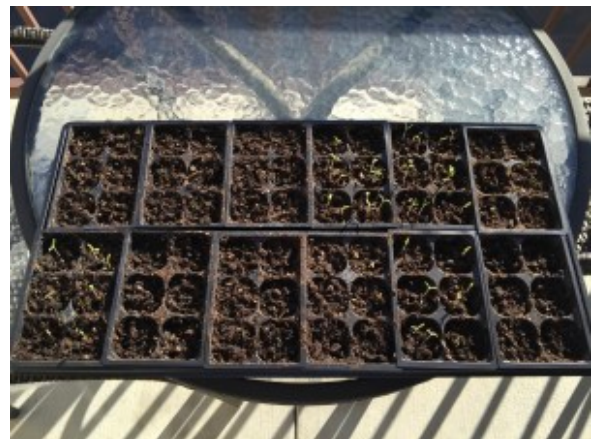
The seedlings starting to germinate

Seeds will take anywhere from a few days to a couple of weeks to germinate. This information should be printed on the seed packet or can be looked up online. In our case, the tomato seedlings are up and growing after a week, but we are still waiting on the eggplant seedlings which will take at least another week to germinate.