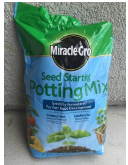
Picking a potting soil

It is important that the potting soil for seedlings has several attributes. The soil needs to be made of fine particles that will hold water around the seed. The soil needs to be sterile so that it will not have weed seeds, fungus organisms, or other organisms. Fertilizer needs to be contained in the potting soil or needs to be added to the soil, so that the plants have nutrients until the time of transplanting.