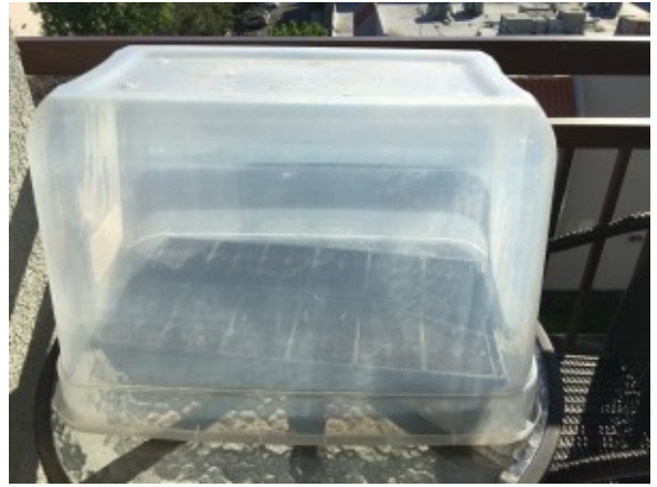
Mini greenhouse made from an upside down storage tub

We seem to have had the most success using an upside down clear plastic storage container with ventilation holes drilled in the bottom of the tub which becomes the top of the mini greenhouse. This top covers the entire planting tray. The holes can be drilled with larger or smaller holes depending on the outside temperature. We have about eight 1/4 inch holes drilled in our tub. For a tub that is in direct sunlight all day, we increased the hole size to 1/2 inch diameter. The height of the tub allows the heat to rise above the seedlings and venting the hot air out through the top. The tub still holds most of the moisture under the tub keeping the humidity high near the seedlings. The high humidity helps with germination and prevents the potting soil from drying out too quickly. We have found that this type of cover is heavy enough to resist light winds and can be further secured by placing a weight on top such as a small brick or stone.