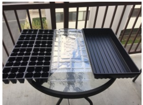
Jiffy® Seed Starter

We wanted to grow a few seedlings. Some varieties that are hard to find, as transplants, at garden centers. We decided to purchase a Jiffy® seed starter kit and add our own potting soil to the six-packs. We chose this system for several reasons: 1) It has trays that will separate into six-packs; 2) It has a tray to hold the six-packs; 3) The tray will also hold any watering overflow; 4) It had a clear plastic cover. 5) The Jiffy kit was also reasonably priced and individuals parts could be purchased separately later.