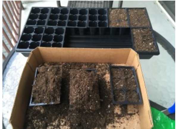
Filling the trays with potting soil

penetration. The potting soil should then be leveled a little below the rim of the cells so that the water can soak in when watering without running off.