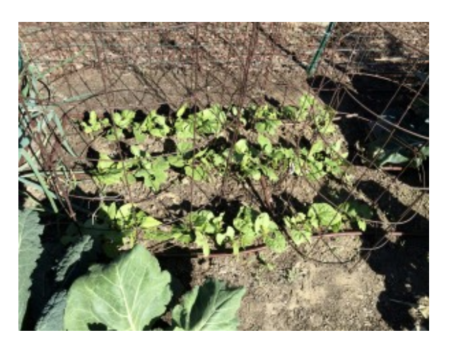
Pole bean seedlings with "Tomato" cages

We have grown green beans as Pole Beans and also Bush Beans. Bush beans grow close to the ground and are usually less than 2 feet tall and normally about 18 inches tall. Pole beans on the other hand, will grow about as tall as you make a trellis. We made our trellis about five feet tall out of well used "Tomato" cages. Trellises can be made a variety of ways and with a variety of materials. The purpose of the trellis is to give the vines of the pole beans something to climb upwards and to make the beans accessible for picking. Without a trellis, the beans will just grow flat on the ground and defeat the purpose of picking pole bean varieties.