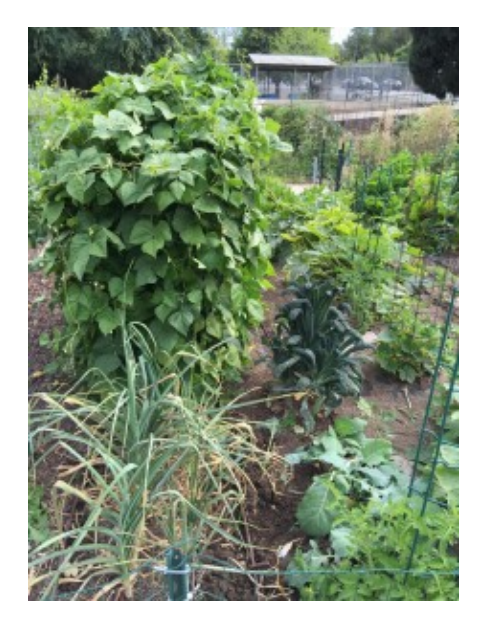
Pole beans blooming and setting beans

When planting beans, peas, and other legume crops, we inoculate the seed with rhizobia nitrogen fixing bacteria. Rhizobia bacteria establish themselves in the roots of legumes, forming nodules on the roots of the bean plants. The bacteria fixes nitrogen from the atmosphere and make it available to the plant. The available nitrogen reduces or eliminates the need to fertilize the beans with nitrogen fertilizer. Many soils naturally have this bacteria present at planting, especially if beans, peas, clover, or other legumes have been grown there previously.