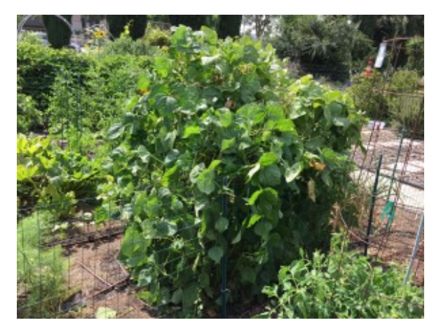
Pole beans at during harvest

We set our tomato cages over the seedlings once they became established and we had controlled all the weeds. The beans will grow rapidly and will begin to bloom. After bloom, the beans will set and form the beans. Pole beans will keep blooming and producing, if the plants remain healthy. It helps to keep the plants healthy, if care can be taken during picking to reduce injury to the vines.