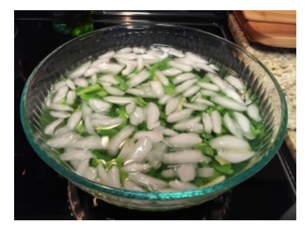
Cooling in the ice bath