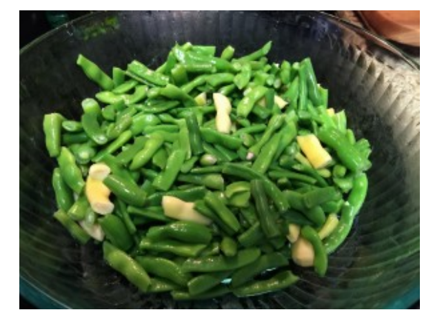
Blanched beans ready for packaging