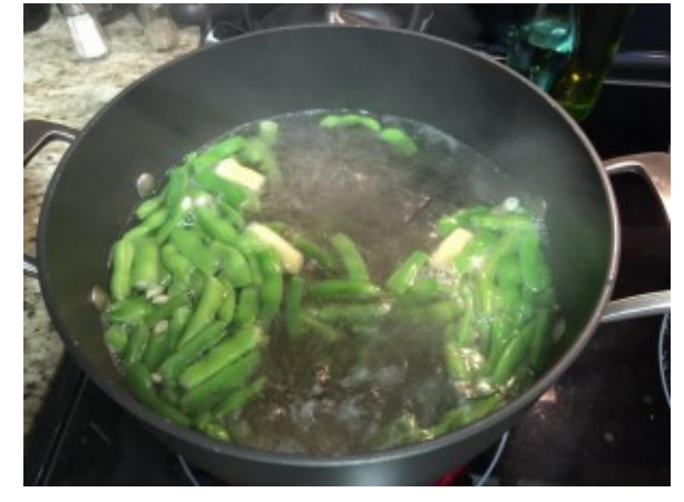
Blanching in boiling water