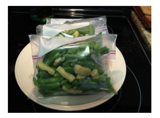
Packaged beans ready to be labeled and placed in the freezer