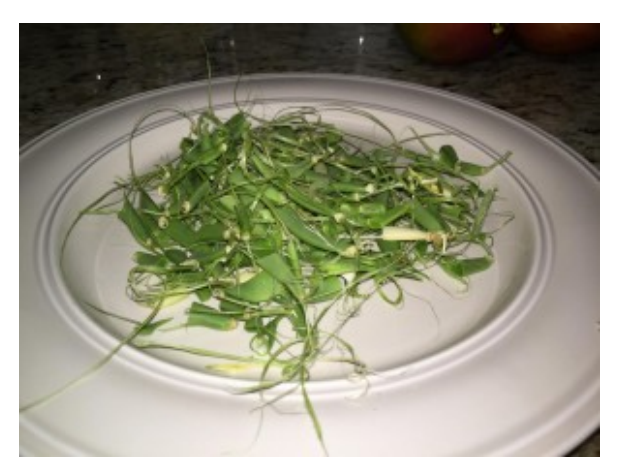
Ends, and strings removed from the beans