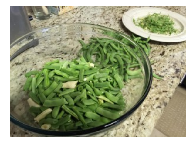
Beans, strings removed and "snapped"