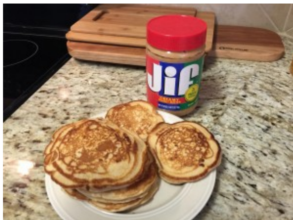
Pancakes with peanut butter in them

Recently we saw an article about Rosa Park's Featherlike Pancake recipe. We also looked online and there were quite a few additional articles about this recipe and Rosa Parks. Rosa Park's was a key African American civil rights activist, famous for refusing to give up her seat on a segregated bus back in December 1955. This action on her part resulted in protests which helped to eliminate segregation laws and helped pave the way towards achieving racial equality. After her death, when going through her papers, this recipe was found written on an envelope among the papers.