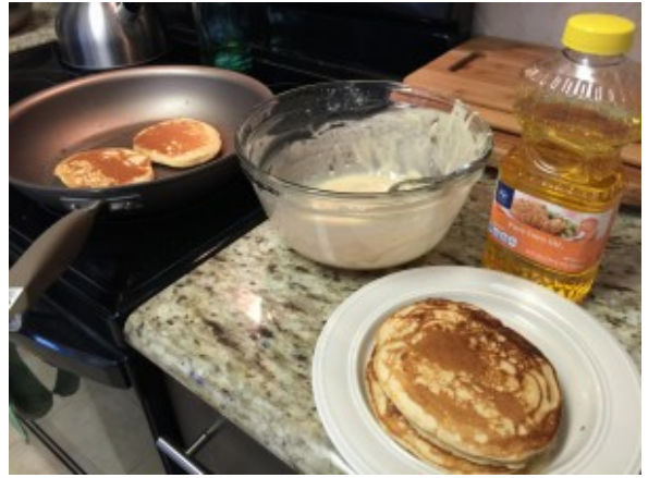
Mix'em, Cook'um, & Serve'm

We really liked this recipe. The pancakes are very fluffy and lite. The peanut taste is there but not overwhelming. We ate ours with, real maple syrup, jam/jelly, and bottled store bought pancake syrup. It all tasted great!! We ate quite a few of the pancakes without anything on them at all. They were almost habit forming; being eaten by the stove and never making it to the table.