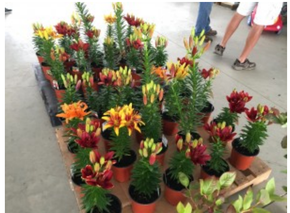
Flowers for sale!

One of our favorite things to do is to visit the Genesee Valley Produce Auction. We visited the auction for the second time in 2017, just before the Fourth of July weekend. The auction is getting into full swing for the summer with a full parking lot of buyers and a variety of produce items for sale. Be sure to take note of the changes of auction days and hours described below, for Summer 2017.